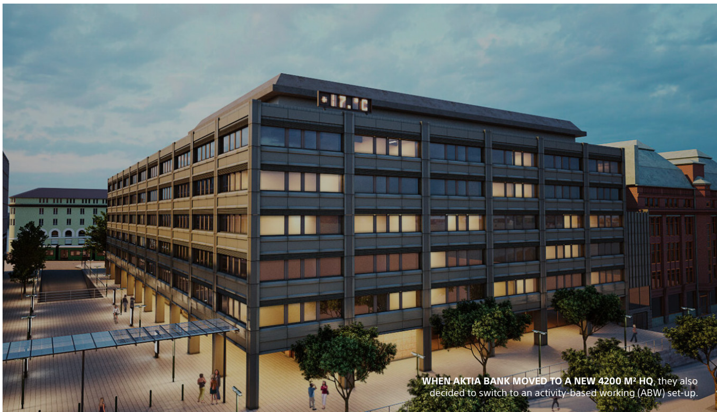
WHEN AKTIA BANK MOVED TO A NEW 4200 M 2 HQ, they also decided to switch to an activity-based working (ABW) set-up.