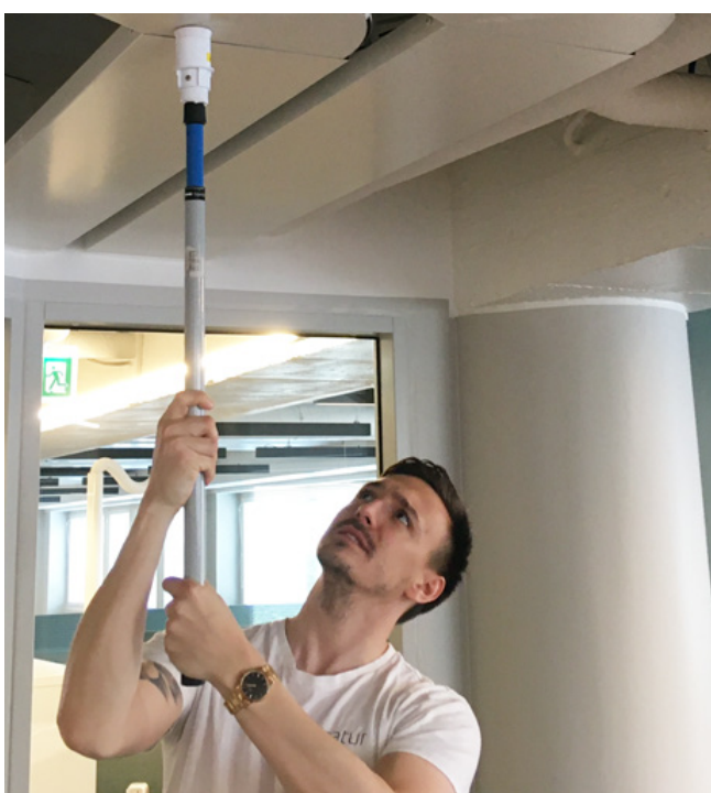
STRATUR'S EXPERTS install beacons at Aktia's new HQ in Helsinki, Finland.